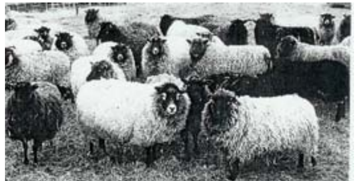
Shetland Sheep in North America