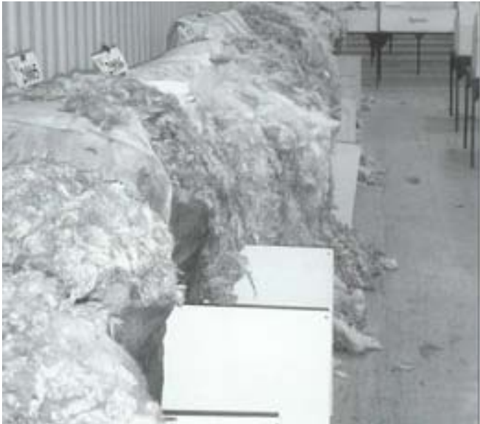
Woolgrowers Independent Selling Services Annual Luster Sale.